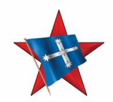
Communist Party of Australia (Marxist - Leninist) www.vanguard.net.au