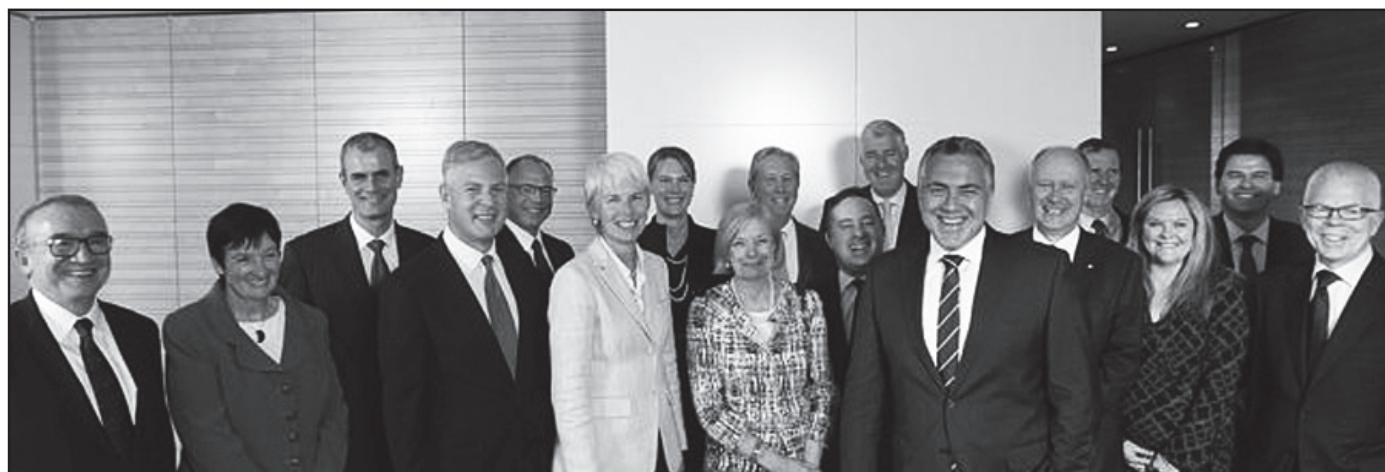
Big business CEOs meet with Treasurer Joe Hockey to lay down their agenda

The reverse side of this "end of the age of entitlement" coin is the massive tax cuts for corporations and for those