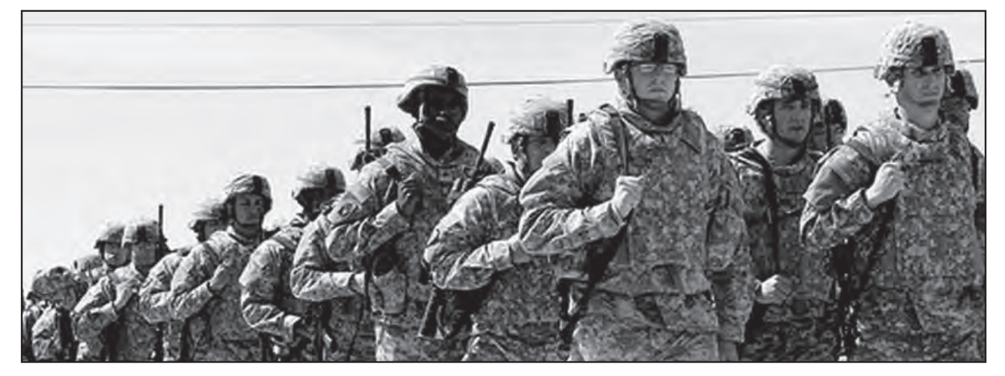
US troops have stayed on in Jordan after large scale exercises in June

In spite of the specialist teams of CIA advisors, the generous supply of weaponry and the infiltration of foreign Islamic fundamentalist extremists, the Assad government has rallied the people and the armed forces to resist the terrorists and the plans of their master.