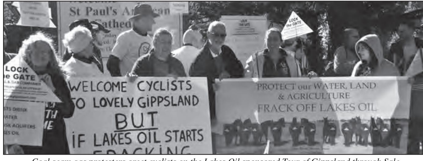
Coal seam gas protesters greet cyclists on the Lakes Oil sponsored Tour of Gippsland through Sale Peoples' struggles like this will intensify

They issue instructions and directives to their lackeys in parliament to step up attacks on the working class to enable big